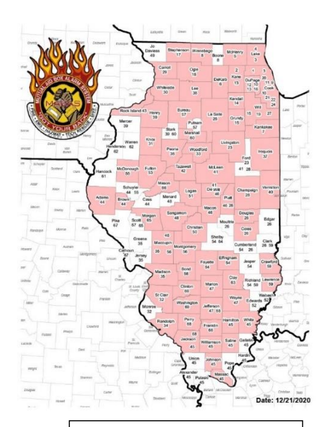
Counties where MABAS provided COVID-19 pandemic response support or equipment are shaded in pink. All 69 MABAS Divisions provided support.