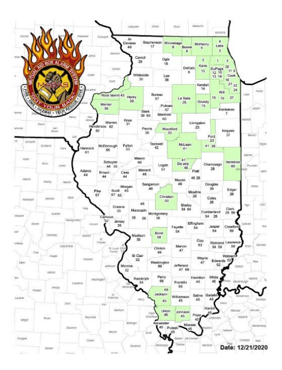
MABAS divisions/counties where ITTF/UASI grant supported special response hazmat, technical rescue and water rescue teams were used are shaded in green.