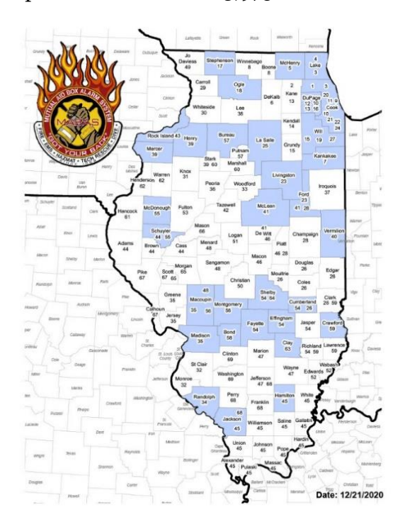
MABAS divisions/counties where ITTF/UASI grant funded equipment or vehicles were utilized at a local emergency response are shaded in blue.