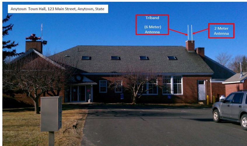
Figure 2. Example of ground-level photograph showing proposed attachment of new equipment.

Ground-level photographs. The ground-level photograph in Figure 2 supplements the aerial photograph in Figure 1, above. Combined, they provide a clear understanding of the scope of the project. This photograph has the name and address of the project site, and uses graphics to illustrate where equipment will be installed.